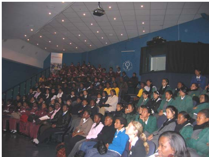
Packed to capacity, the auditorium for the SAWISE-Element six morning event.

Besides showcasing the careers in science, we also ensured that all the major universities in the Western Cape (i.e. UCT, UWC and US) were able to distribute pamphlets about studying science at their universities.