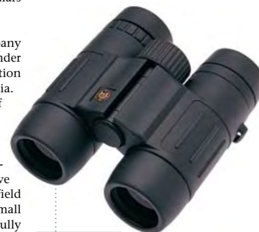
LYNX 44 8x32

The pick of the crop was the 44-series 8x32, which has a nice, compact design and offers amazingly close focus. For its