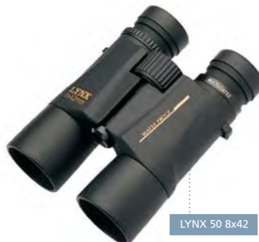
LYNX 50 8x42

Overall, the Kowa 8x42 is an excellent mid-level pair of binoculars, and the Lynx 8x32 is the best entry-level model reviewed by this magazine to date. □