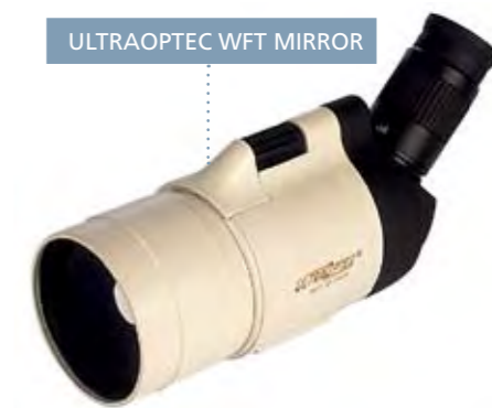
ULTRAOPTEC WFT MIRROR

The larger image size of a fixed wide-angle also makes it easier to capture good digi-scope images. □