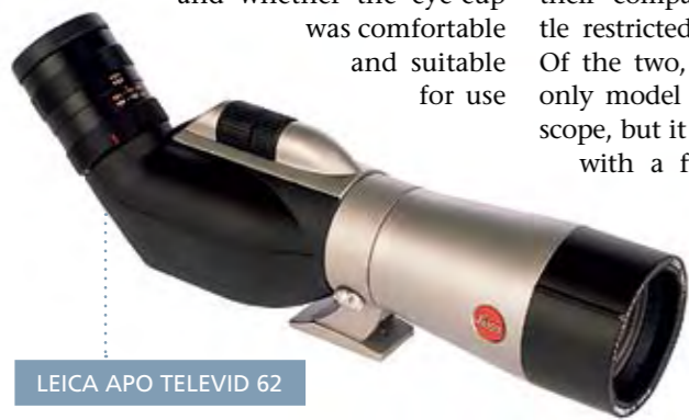
LEICA APO TELEVID 62