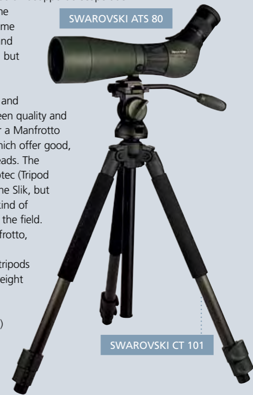
SWAROVSKI ATS 80

At the top end of the market are tripods with carbon-fibre legs that reduce weight without compromising stability. This freedom comes at a price, however. The Velbon CF 530 Sherpa Pro (2 kg) is about R4 000 (depending on the head choice) and the Swarovski CT 101 (2.1 kg) is R4 750.