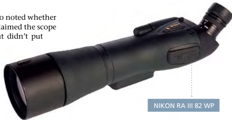
NIKON RA III 82 WP

Unlike binoculars, the relationship between cost and quality is roughly linear for telescopes, so you really do get what you pay for. The panel was unanimous in discriminating three categories of scopes.