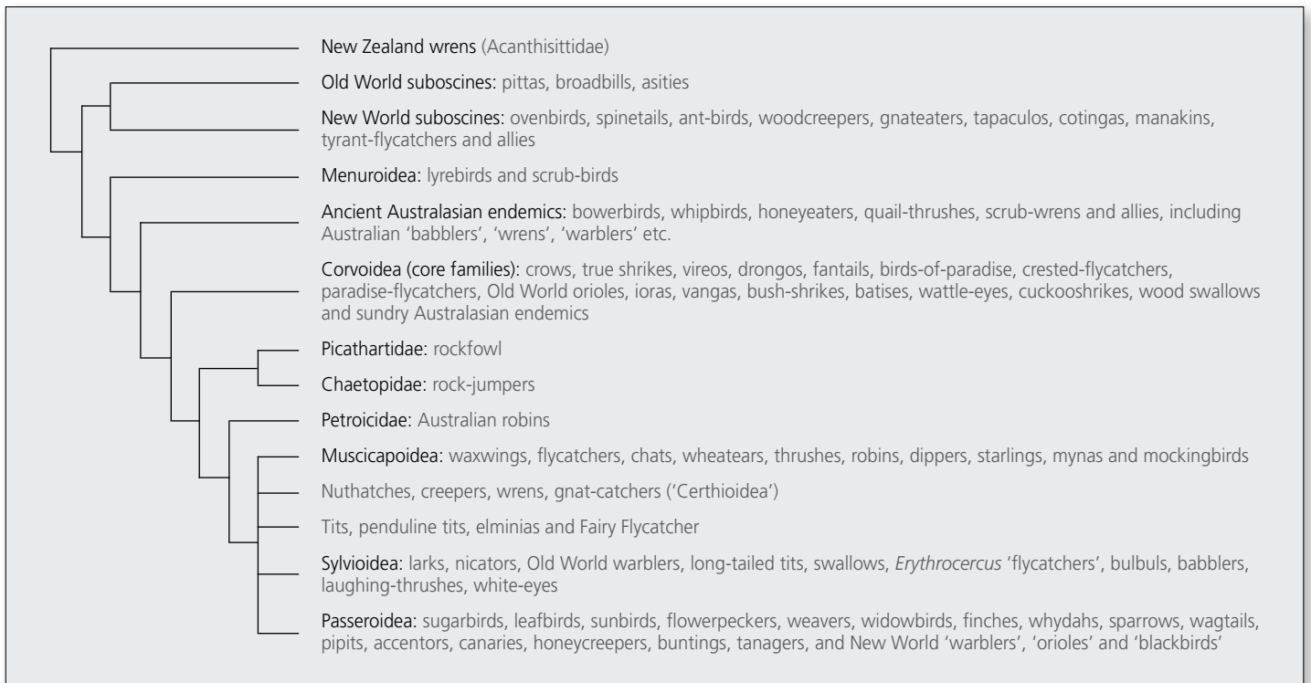
Relationships within the Passeriformes, the largest order of birds.

Some birders may consider these discoveries irrelevant, and grumble about changes to the old, familiar bird sequence. But you cannot understand an organism and how it fits into its environment without also knowing its evolutionary history, and the constraints imposed by that history. Knowing the relationships among the birds we watch can only enhance our birding experience. □