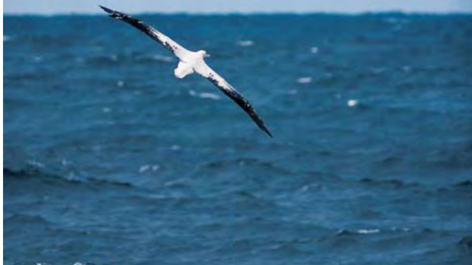
The Wandering Albatross – one of the vulnerable seabird species.