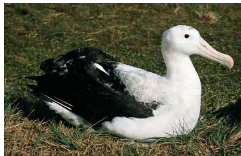
A nine-year-old Tristan Albatross (presumed female) breeding at Gough Island (far left) appears similar to a dark, five-year-old non-breeding Wandering Albatross on Marion Island (centre), and is considerably darker than another five-year-old non-breeding female Wanderer (left).

A lbatross taxonomy has undergone some radical changes in the last five years, expanding from 14 species to as many as 24 species in four genera (see Africa – Birds & Birding 2(1): 35). The great albatrosses have been most affected, with seven species in the complex: