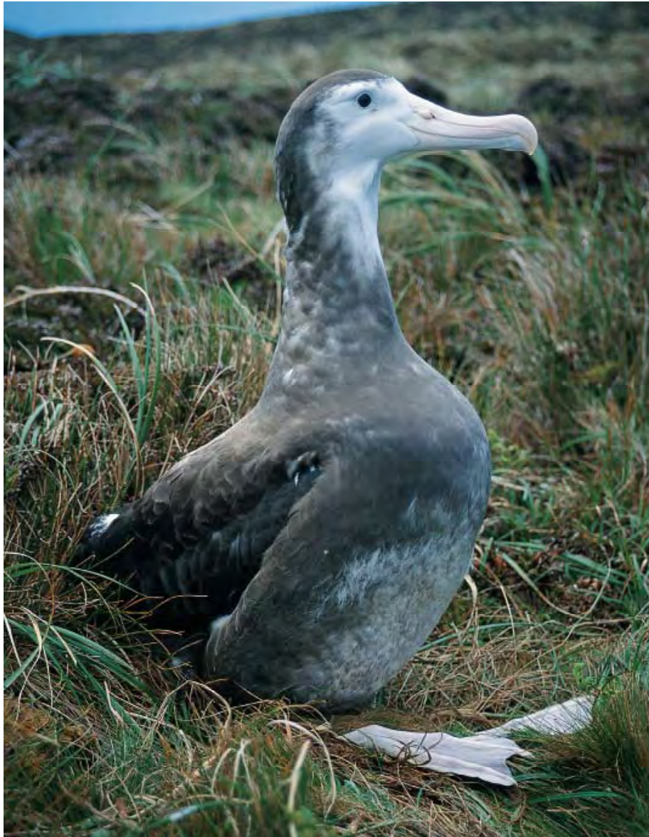
A Tristan Albatross fledgling on Inaccessible Island. Note the paler, greyer plumage than that of a Wandering Albatross of the same age.

Two types of Wandering Albatross occur off southern Africa: the larger, southern-breeding Diomedea [e.] exulans and the smaller D. [e.] dabbenena from Tristan and Gough. They are now treated as separate species by most authorities, but how easy is it in fact to separate the two species in the field? ▷