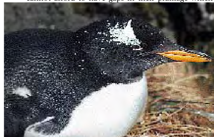
GENTOO PENGUIN PETER STEYN

What can the juveniles do? Jackass Penguins do something that no other penguins are known to do: they undertake a partial moult into adult plumage. Conventional wisdom has it that penguins are constrained to replace all their feathers at once. This is because they cannot afford to have gaps in their plumage which dis-