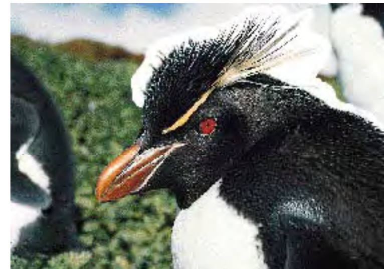
ROCKHOPPER PENGUIN PETER RYAN

Each penguin species has a unique head pattern. These almost certainly play an important role in species' recognition during mate selection, but it is not a coincidence that these unique patterns are located on the head. The head is the most visible part of swimming birds, and these patterns are thought to allow birds to identify those of the same species at sea. Alcids, the northern hemisphere ecological equivalent of penguins, also tend to have species-specific head and bill markings.