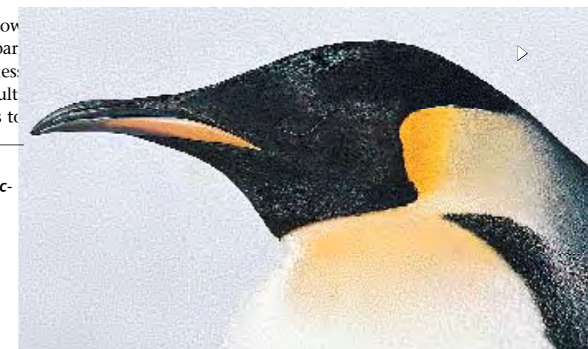
EMPEROR PENGUIN PETE OXFORD

Whatever the balance of honesty and deception, the