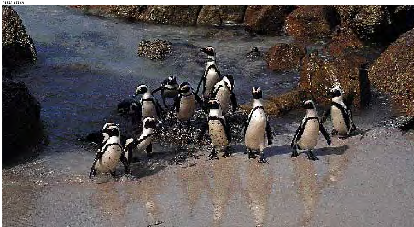
Magellanic Penguins (above) have double breast bands, making them even more conspicuous at sea. A few Jackass Penguins (such as the bird below, centre back), also have double breast bands; it is not known whether this unusual trait is inherited, but the proportion of birds with double breast bands varies between breeding colonies.

With a maximum swimming speed of five kilometres an hour, they are much slower than are adult birds (see box, page 50), and are incapable of catching schooling fish which swim at 8–10 kilometres an hour. As a result, young penguins feed on slow-moving, solitary prey such as larval fish and pipefish. For fledglings, camouflage is essential both to minimize the risk of predation and to allow them to sneak up on their prey.